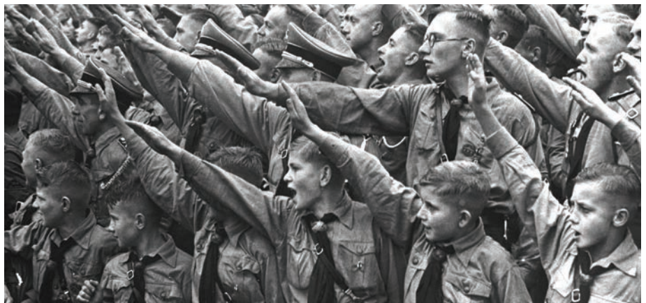
Members of the Hitler Youth, caught up in the fervor of fascism, salute Hitler.

A fascist government also controls the media and the messages it sends. It circulates lies and misleading information called "propaganda." These posters and programs often blame a group of people for the country's problems and glorify the leader. (continued on next page)