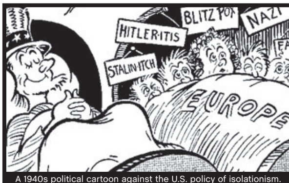
A 1940s political cartoon against the U.S. policy of isolationism.