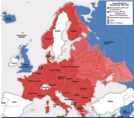
A map of the countries Germany and its allies took over in Europe and the north of Africa. The white countries remained neutral during the war. The other half of World War II was against Japan in the Pacific.

World War I and the Treaty of Versailles, which officially ended the war, devastated Germany's economy, dismantled its military and humiliated the German people. In this treaty , other countries forced Germany to take full responsibility for World War I including the millions of people who died.