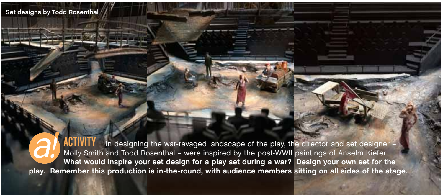
Set designs by Todd Rosenthal

While the play is set in the landscape of the Thirty Years' War, Brecht wrote it in 1939. World War I had ended in 1918 and approximately 16 million soldiers and civilians were dead. Just 20 years after this “war to end all wars,” Hitler was rising to power and Europe was on the brink of total war again. Why do you think Brecht, a 20th-century writer, set the play during a 17th century war?