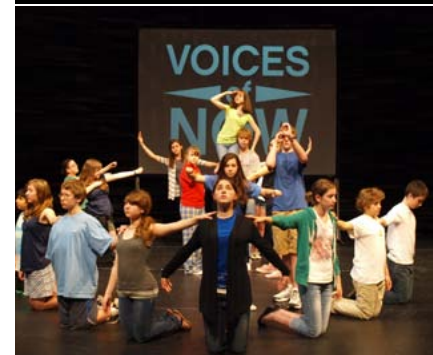
Voices of Now students showcase their final work