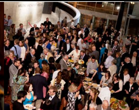
Crowd gathers at opening night of Ah, Wilderness!